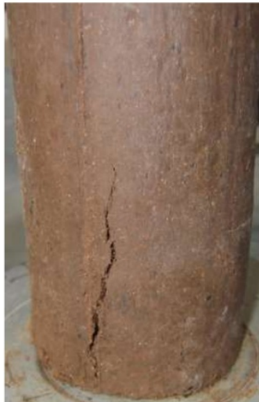
Figure 5. Morphology of Specimens After Compressive Test.

Based on figure 5 it can be seen that the maximum stress obtained from the compressive strength of the clay used in the research of the open channel scour model is 0.95 \text{ kg/cm}^2 . The specimen illustrates that the compression stress of treated soil increased with an increase in axial strain up to a certain peak. After reaching the peak strength, the unconfined compression stress was stable while the axial strain increase and strain softening occurred prior to fracture. It is evident that treated soil with lime and cement has ductile behavior in compression.