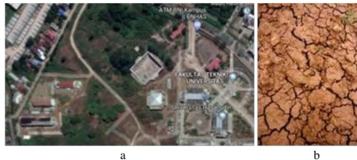
Figure 1. (a) Soil sample quarry (b) clay soil visualization.

The quarry of soft soil samples using in this research was excavated from the University of Hasanuddin development site in Gowa as shown in figure 1a. Visually, soil samples colored with reddish brown with a fine grain as shown in figure 1b. The basic properties analysis of soil presented that the soil classified as clay with high plasticity (CH) based on USCS standard. Properties of soil presented in table 1. Figure 2 shows the result of the sieve analysis. The general properties of laterite soil can be classified into the A-7-5 group according to ASTM D-427.98 [6].