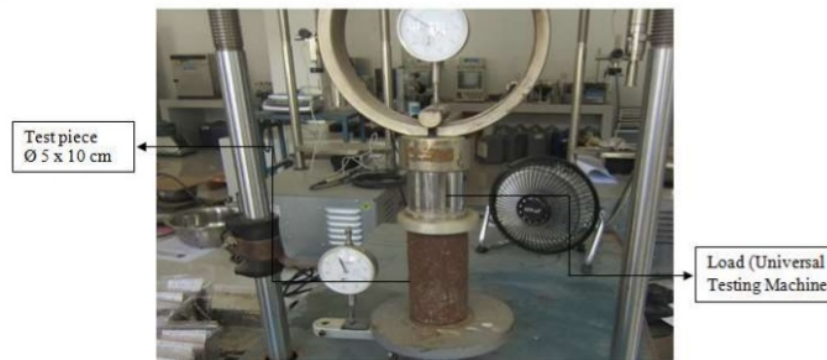
Figure 3. Equipment of UCS test in a laboratory.

UCS test was conducted according to SNI 03-6887-2002 [7]. Figure 3 shows the UCS test in the laboratory. The soil samples for UCS test were prepared using cylindrical molds, which have an inner diameter of 5 mm and a height/diameter ratio of 2.0 for reducing the end effects during UCS testing. Three replicates of each sample set were prepared to assure reproducibility.